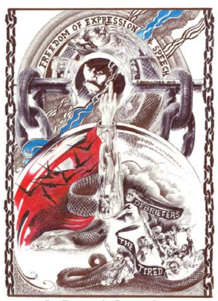
By Fernando Bermudez

No matter where force-feedings take place, whether in Guantánamo or Connecticut, they are considered torture by most of the world's medical and governing bodies. As U.N. High Commissioner for Human Rights Rupert Coville said this week about